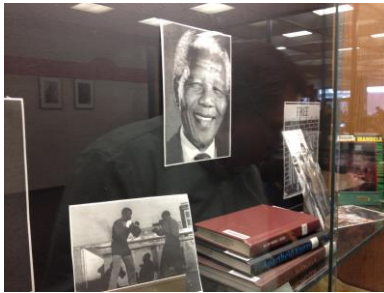
Photo of Library Display